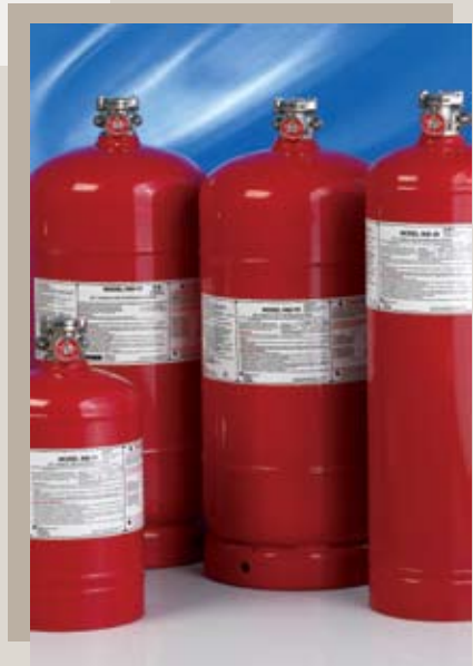
Kidde IND™ System

The Kidde IND System is available in two basic configurations: as a local application system or a total flood system. A local application system is designed to protect a specific piece of equipment, a total flood system is recommended for protection of enclosed rooms or spaces. In addition to the configurations, the Kidde IND System also offers options for detection and control to create a system that will be ideal for your application. Your Kidde Distributor can help you design the right system, and the right approach, for your application.